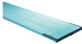
DURAFLEX 14 ft